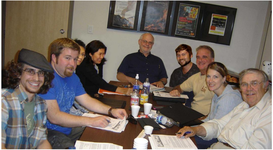
The VCN Board & Staff enjoy a light moment during the summer of 2011

VCN is a worthwhile activity, and we can always use willing volunteers.