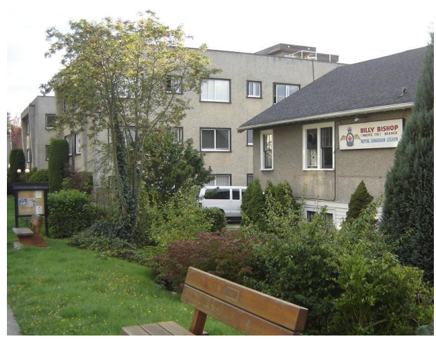
The Billy Bishop Legion looking south-west along Laburnum St. in Kits Point area.

We are particularly pleased that this site is open evenings, when many other sites are closed. This Public Access site is a VCN initiative, and not a Federal funded CAP Site. ...ED