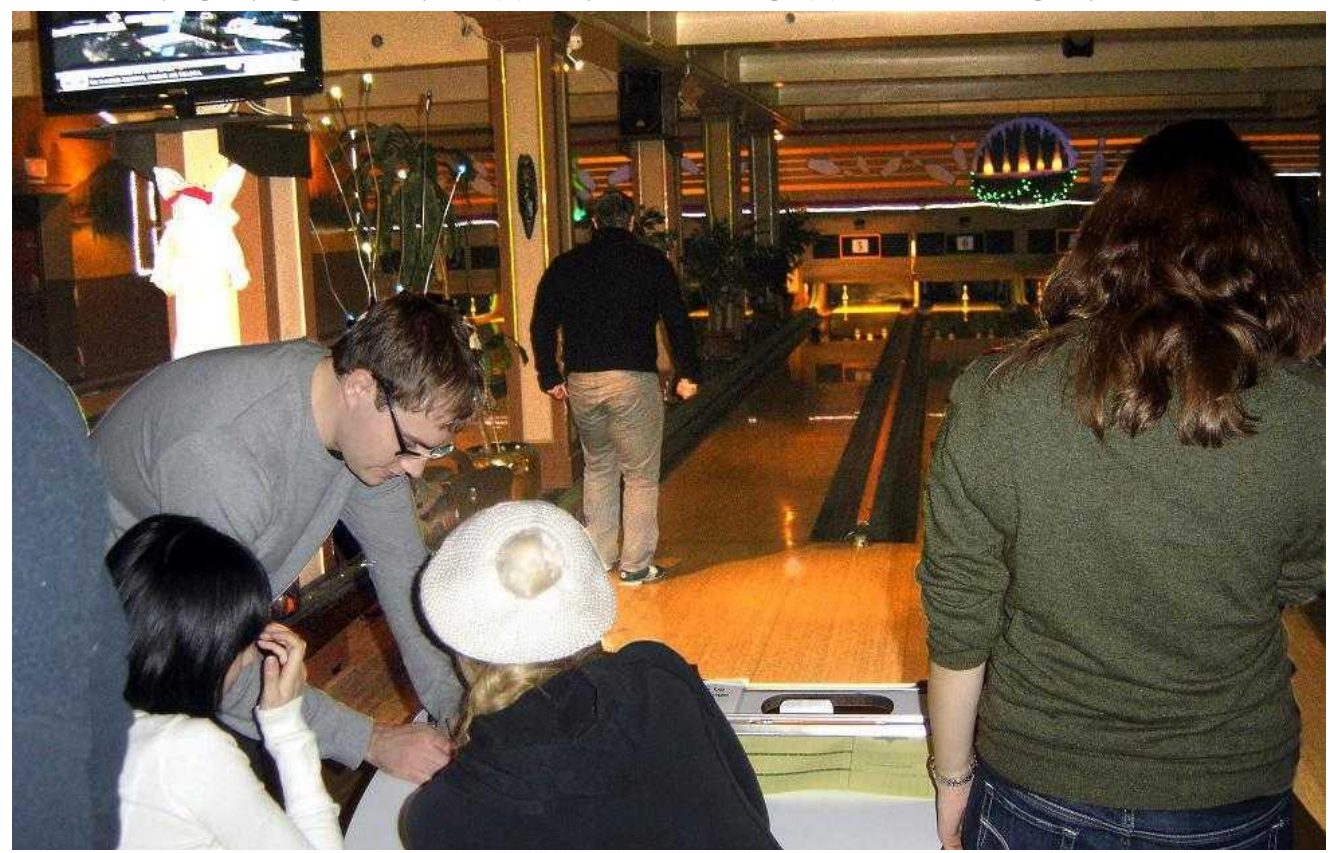
CAPYI Interns enjoy VCN's Bowlathon at the nostalgic Commodore Lanes on Granville. More on Page. 7 Editor's Pic